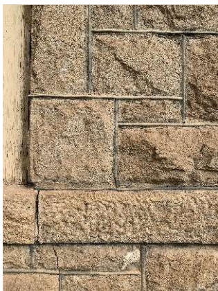
Existing Historic Mortar