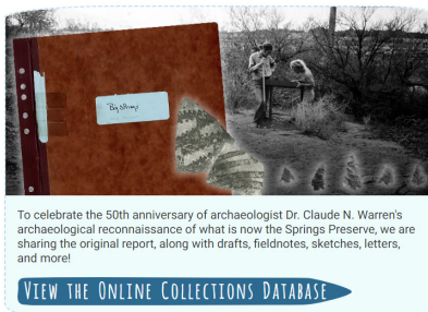
Online Collections Database for the Springs Preserve