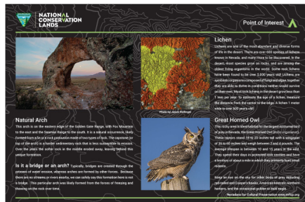
Interpretive Sign for the Bureau of Land Management