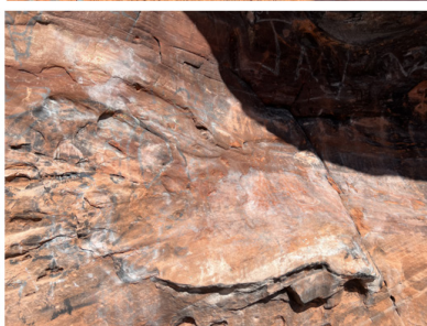
Before and After Graffiti Remediation