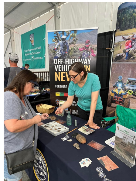
Outreach Booth at the Clark County Fair