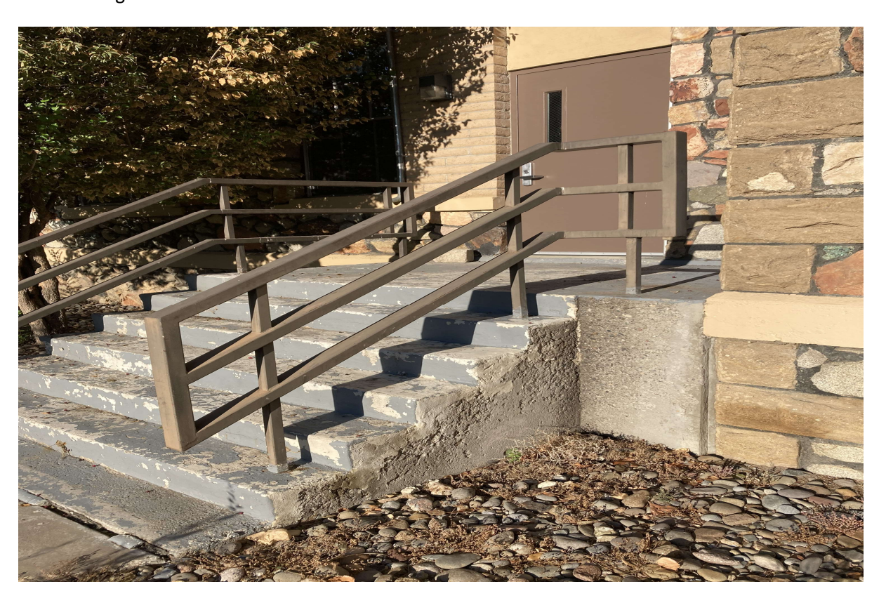
Southeast Building Entrance Stairs