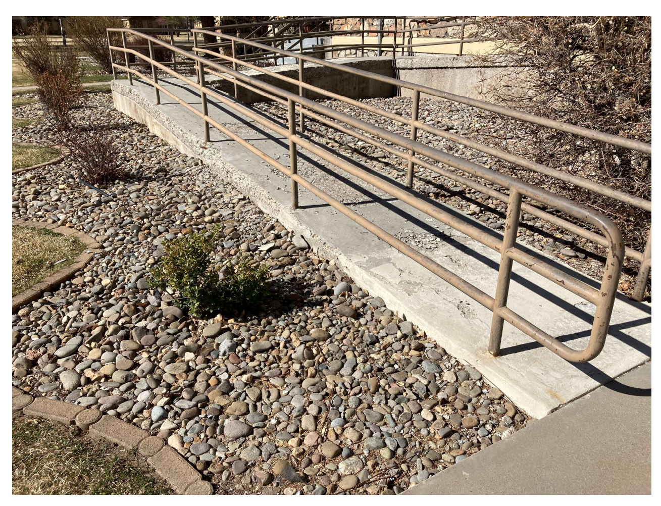
East Ramp Lower Level

All proposed building materials will be concrete and all existing stone work will not be disturbed to preserve the architectural character of the building.