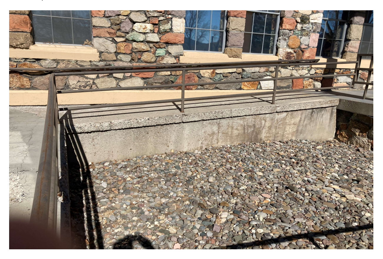
East Ramp Upper Level