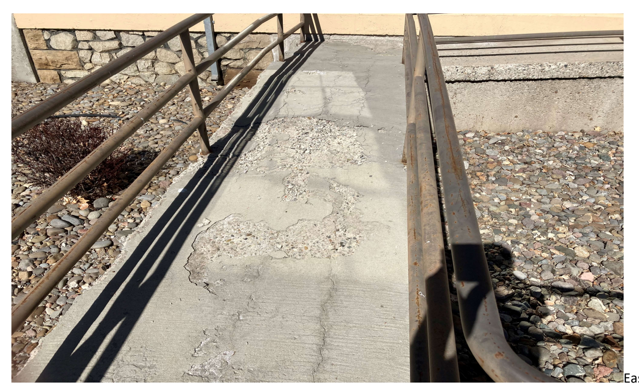
East Ramp Middle Level