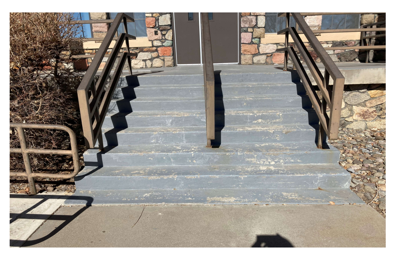
East Building Main Entrance Stairs