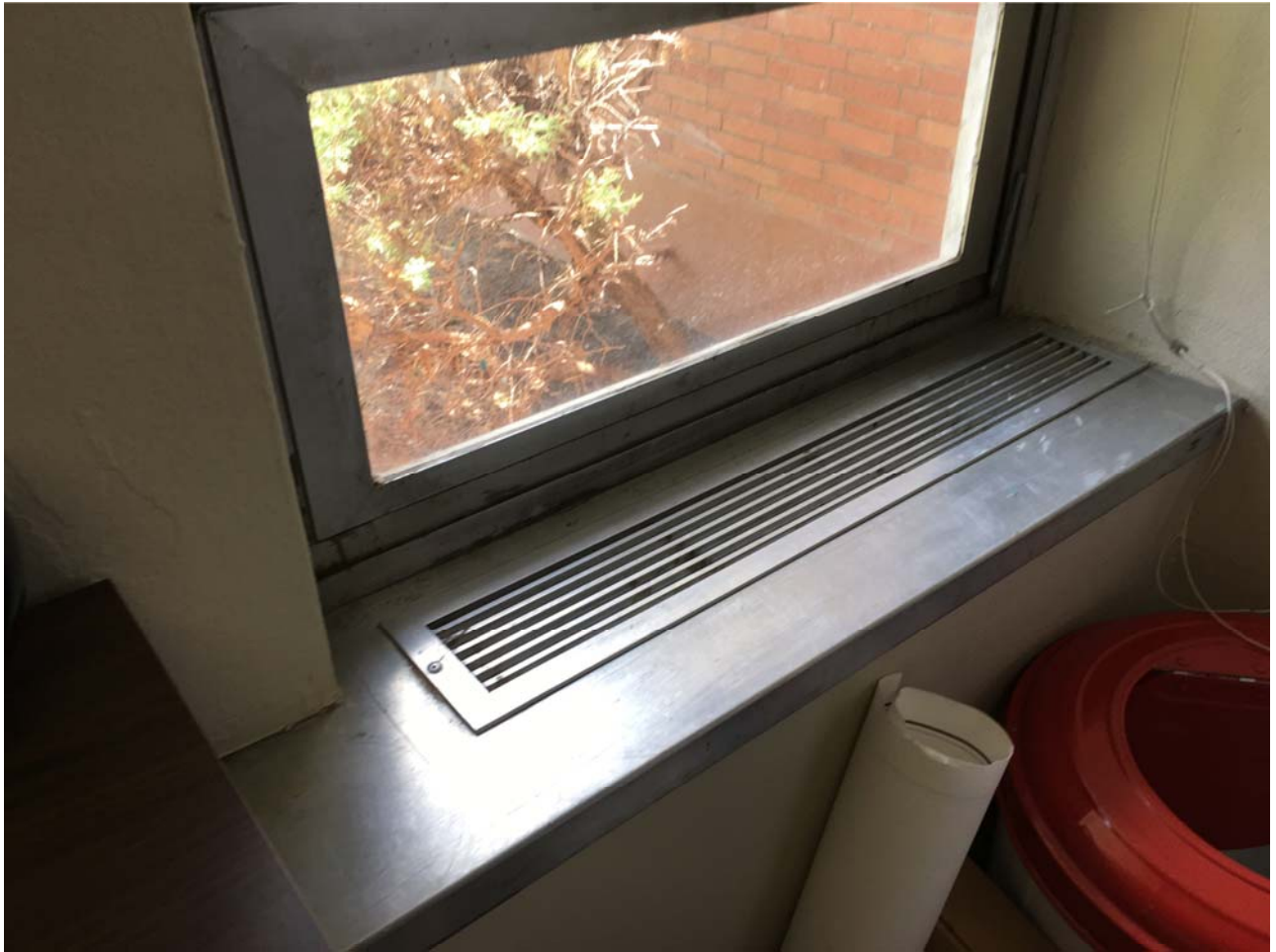
Sheet metal window sill top (typical of several locations)