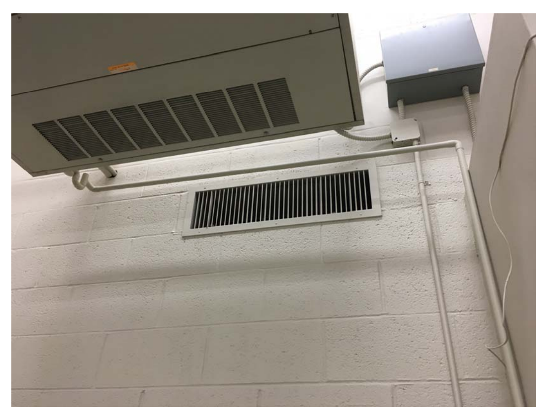
Visible opening (typical of two storage rooms)