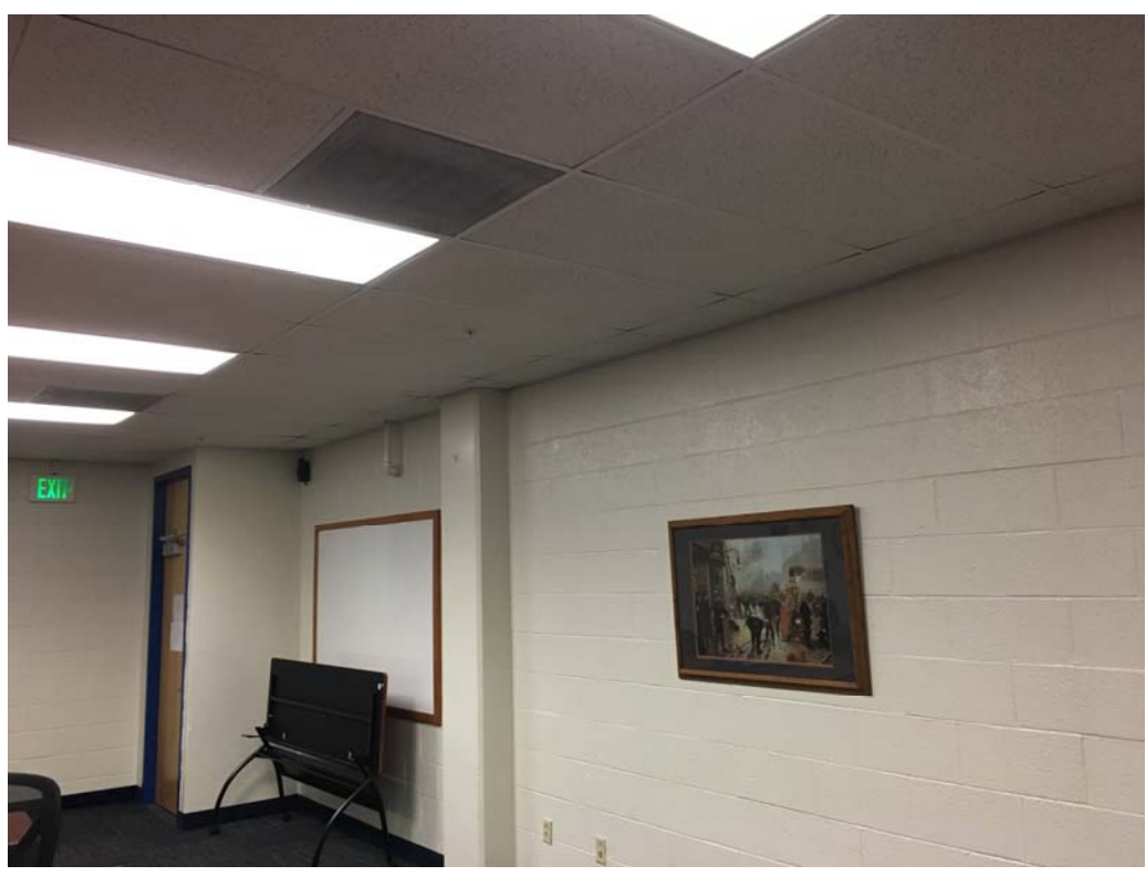
View from inside training room. Non-visible openings are above ceiling (typical of four locations in training room)