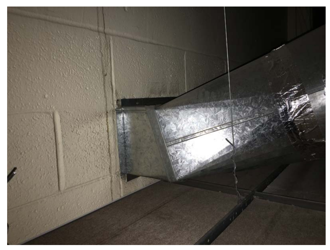
Non-visible opening above ceiling (typical of four locations in training room)