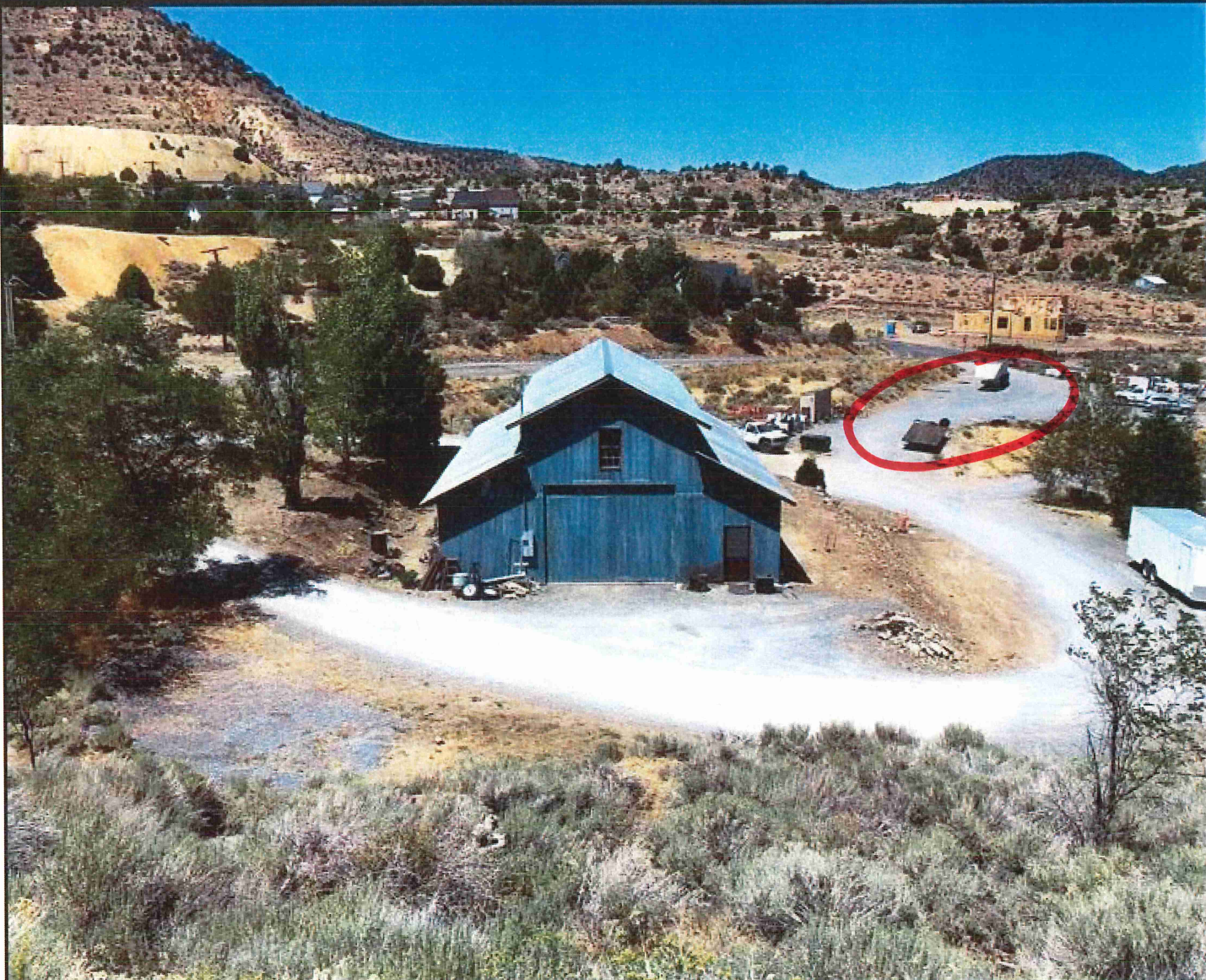
thumbnail_655 6 Mile Cnyn Rd Russ Brandon001.jpg