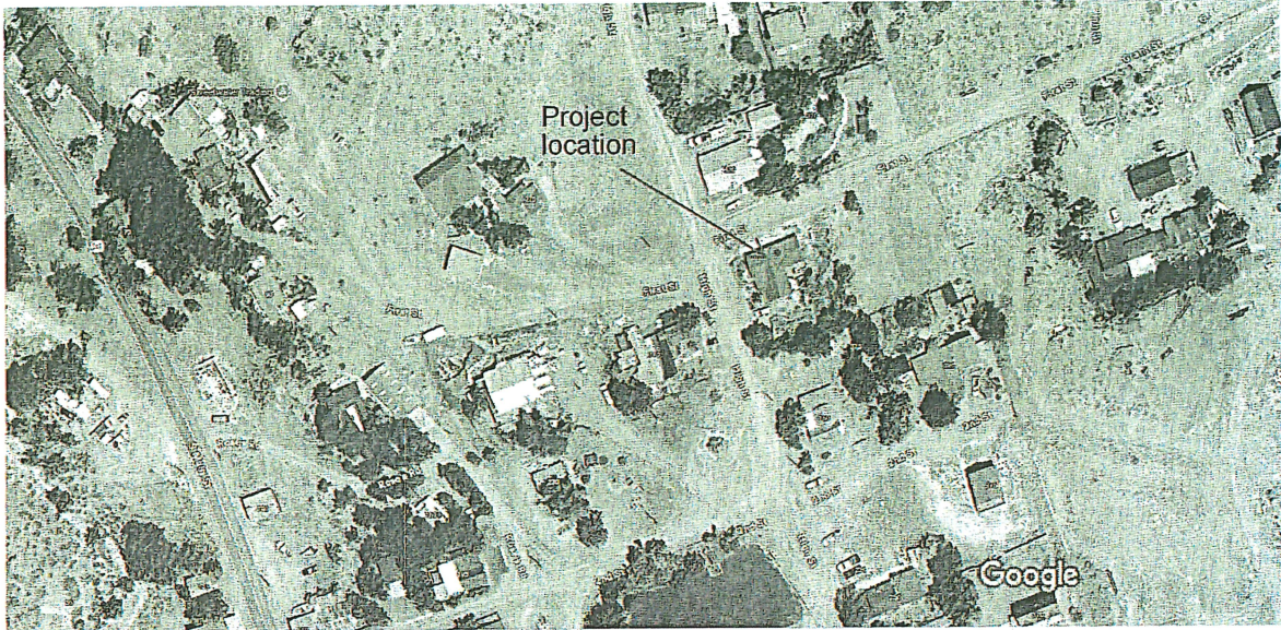
Imagery ©2024 Airbus, Imagery ©2024 Airbus, Maxar Technologies, Map data ©2024 50 ft