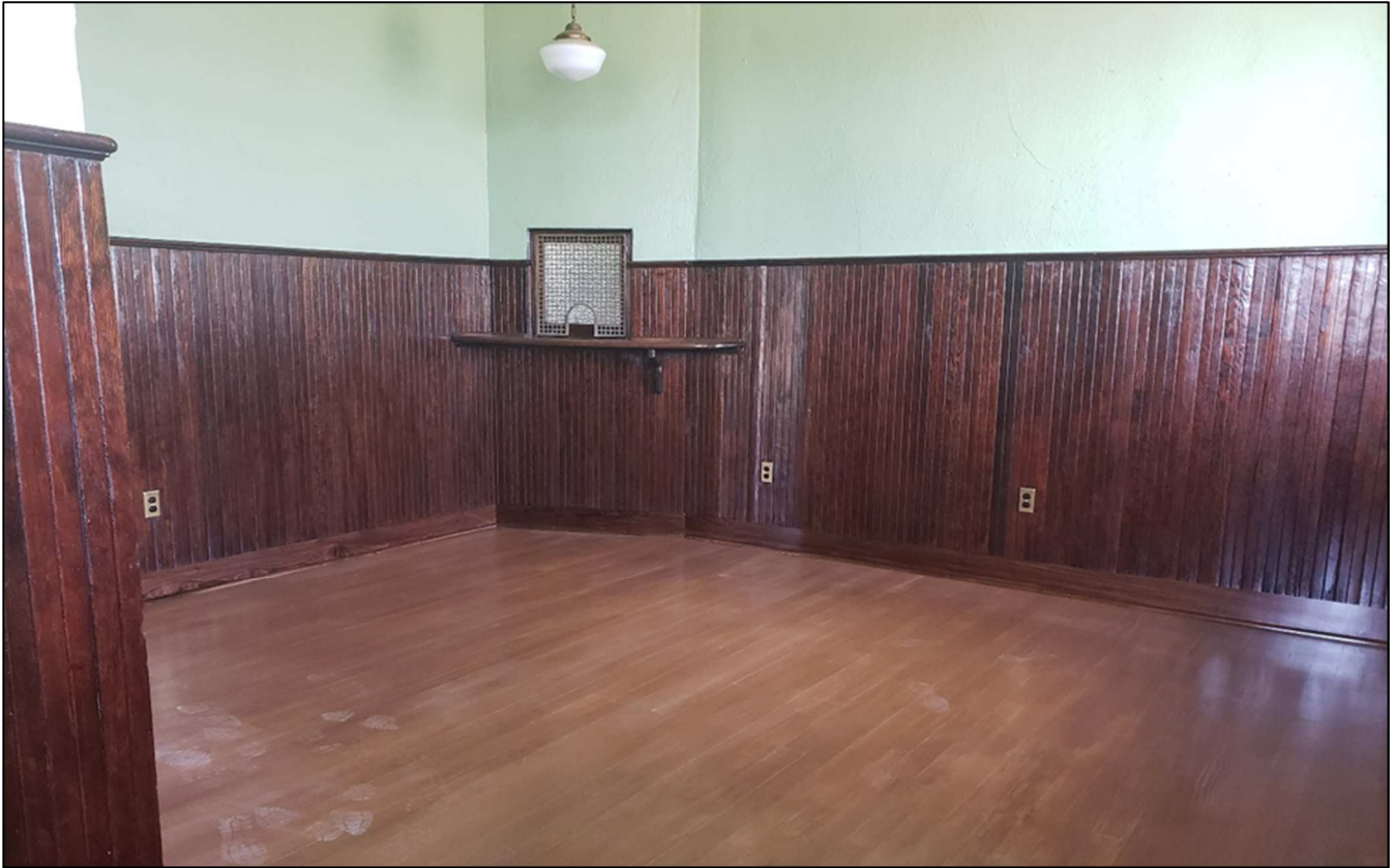
Above is the Men's Waiting Room; below is the Women's Waiting Room. Both rooms have had the ceilings, walls and floors repaired. New electrical service has also been installed.