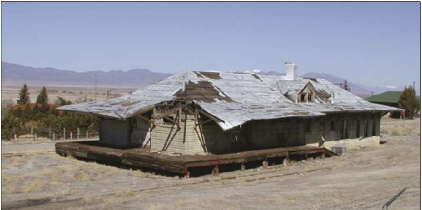
This was the condition of the building when the project started.