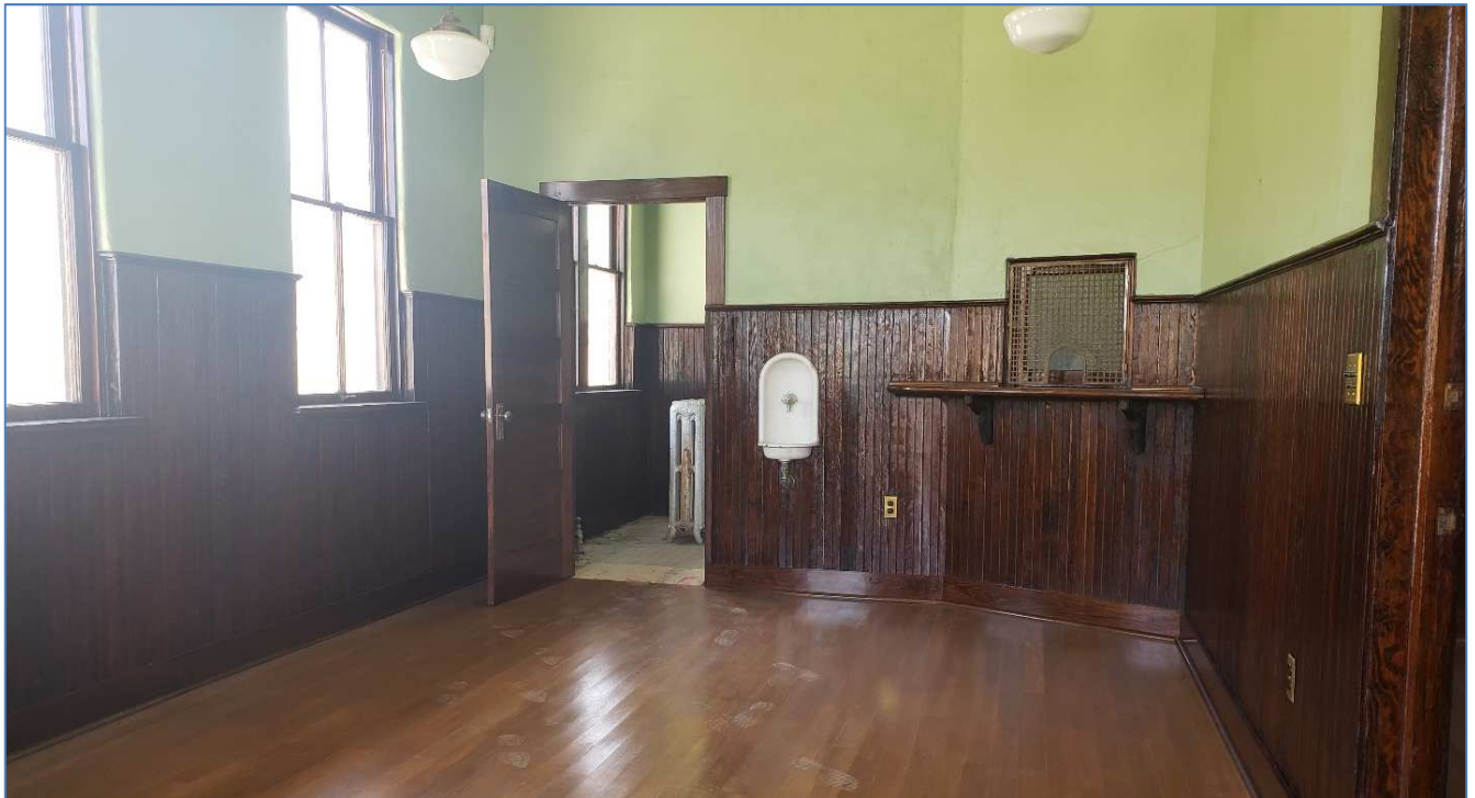
This is a view of the Women's Waiting Room; the doorway leads to the Station Master's office.