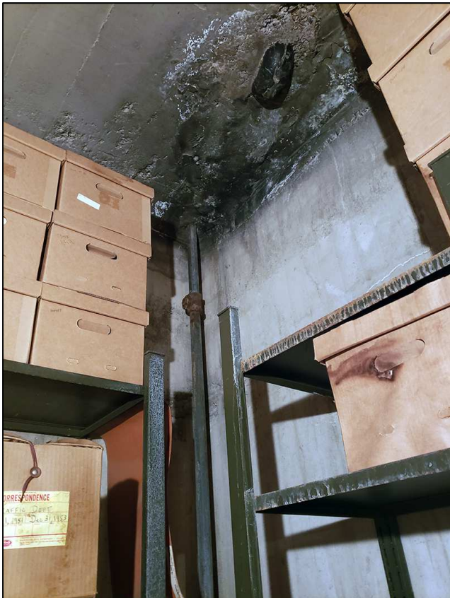
The photo to the left shows the water and sewer pipes in the vault that need to be removed. Visible in the photo are some of the record boxes that are stored in the vault. These boxes contain records that can date to 1905.