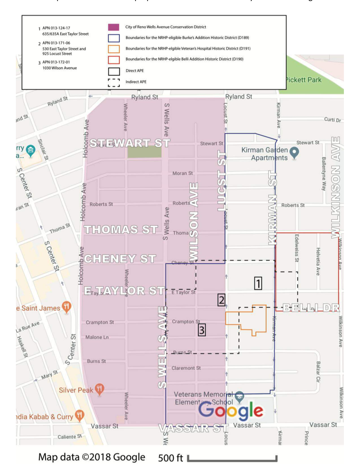
MAP 1 Map 1 illustrates Historic properties that will be affected by this undertaking.