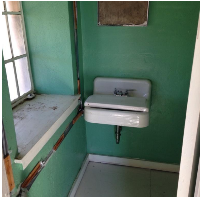
Figure 6 – Existing Restroom Wall Mounted Lavatory