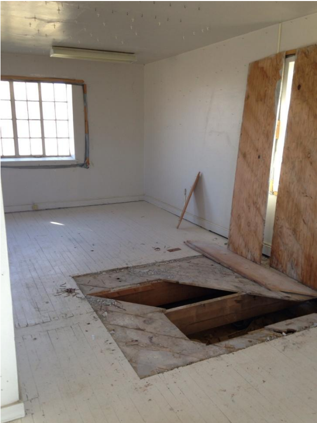
Figure 7 – Existing Interior, North Side