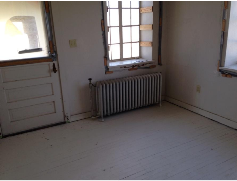
Figure 9 – Existing Interior, Northwest Side