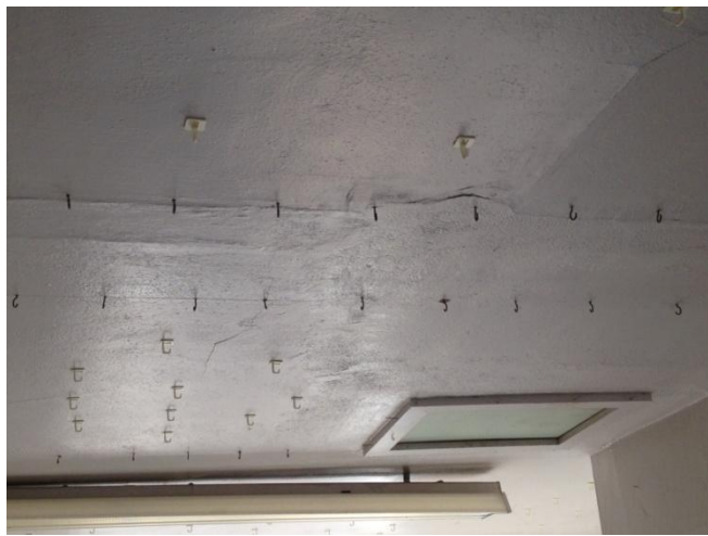
Figure 2 – Existing Ceiling