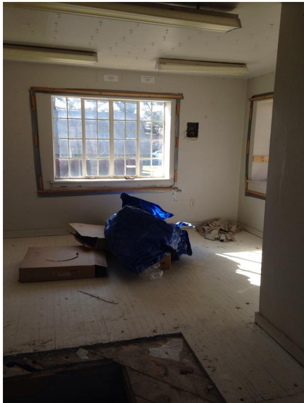
Figure 8 – Exist Interior, South Side