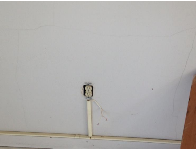
Figure 3 – Existing Electrical Wall Outlet