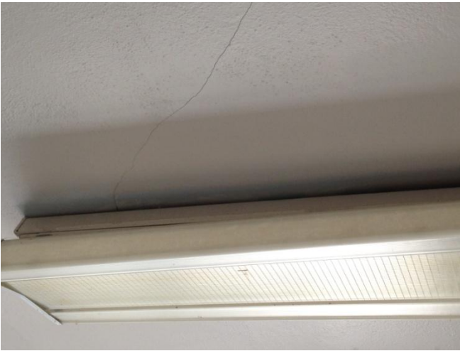
Figure 1 – Existing Surface Mounted Light Fixture