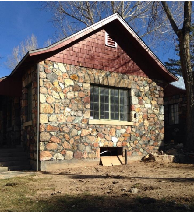
Figure 5 – Existing South Exposure