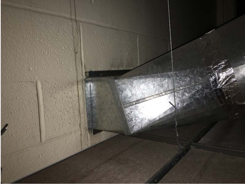
Non-visible opening above ceiling (typical of four locations in training room)