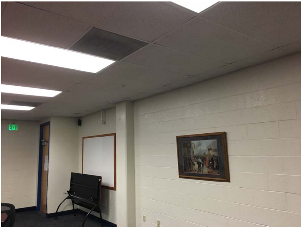
View from inside training room. Non-visible openings are above ceiling (typical of four locations in training room)