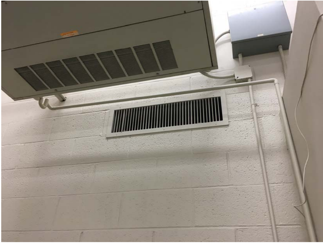
Visible opening (typical of two storage rooms)